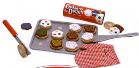
Melissa & Doug